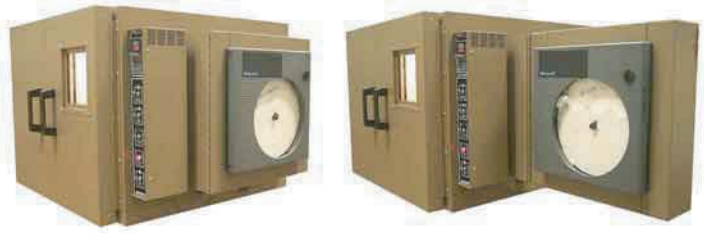
MODEL 21-350ER shown with optional window and chamber light & 10" "swing-out" circular chart recorder